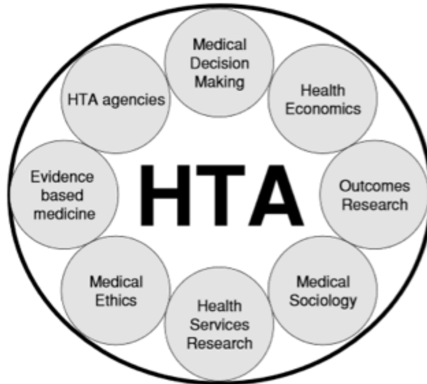
Figure 1. Health technology assessment (HTA) is an interdisciplinary movement.